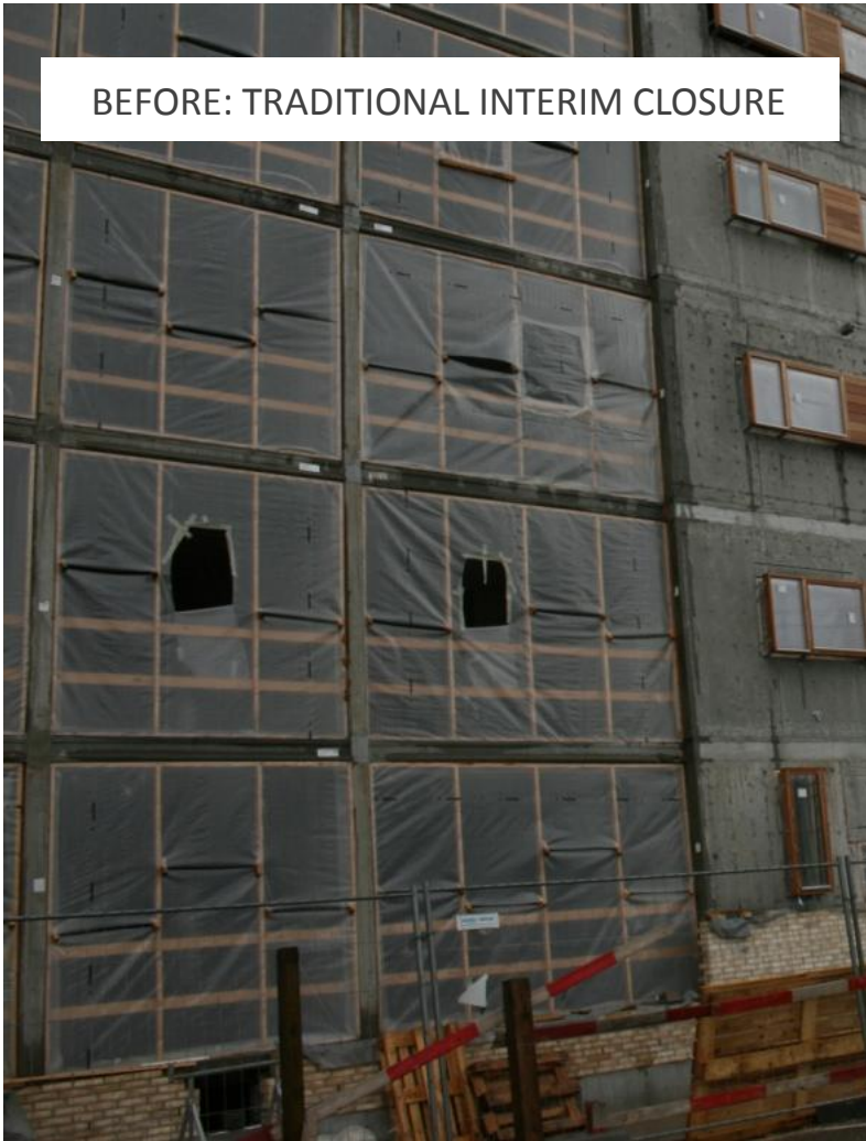
BEFORE: TRADITIONAL INTERIM CLOSURE